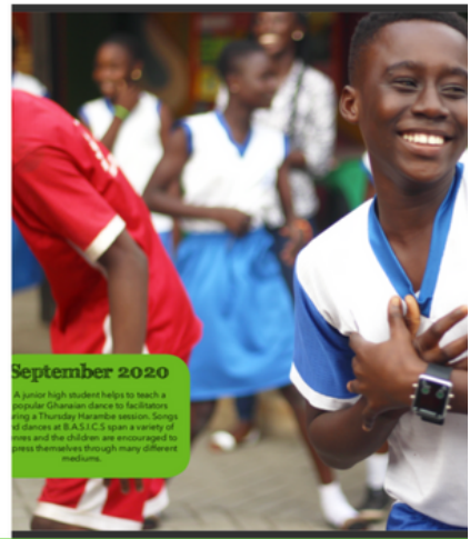
September 2020 A junior high student helps to teach a popular Ghanaian dance to teachers during a Thursday Maranatha session. Songs of praise at B.A.S.I.C.S. open a variety of ways and the children are encouraged to express themselves through many different mediums.

order online today @ https://basicsinternational.org/2020-calendar/